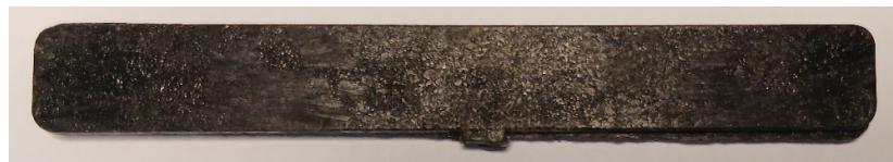
Figure 2. WPC Specimen

The dried wood powders are mixed with shredded polypropylene at a weight fraction of 20% wood powder using an internal mixer. The wood fraction was set at 20% by weight, based on previous studies indicating that this ratio provides an optimal balance between mechanical strength, processability, and dimensional stability[23]. A maleic anhydride-grafted polypropylene (MAPP) coupling agent is added to enhance compatibility between the wood powder and polypropylene matrix [24]. The mixture is processed through an extrusion machine, where it is heated, melted, and thoroughly mixed to ensure uniform distribution of the wood powder within the polymer. The extruded material is then cooled and cut into pellets, which are subsequently molded into test specimens using an injection molding machine. The molding temperature is maintained between 180°C and 200°C to achieve optimal specimen formation [25].